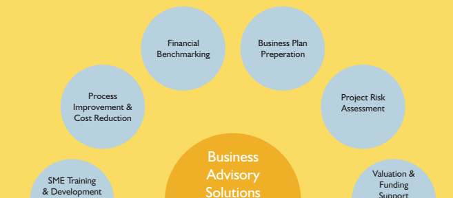
Figure 3: SME Integrated Solution Framework

Business Advisory Services for SMEs leverages D&B's longstanding experience of working with SMEs to provide solutions from the point of idea-generation to facilitating funding for new products, businesses and related or unrelated business diversifications. SME Integrated Solution Framework is a modular solution offering for SMEs, with five levels of engagement that are independent yet integrated.